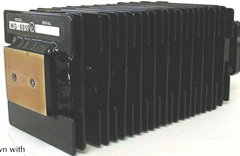
WG-0055 shown with Type II mounting used.

Microlab/FXR WG series dummy loads are optimized versions of the DA loads per MIL-D-3954A or their commercial equivalents. Superior performance is achieved by slight changes in physical dimensions, more efficient fin cooling and increased waveguide pressure. Also, additional mounting in the form of tapped holes with stainless steel inserts are provided at the rear of the loads.